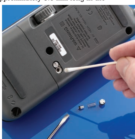
Cleaning the fluid trap in the Fluke-718 Calibrator is quick, easy and only requires a slotted screwdriver and cotton swab

relaxed state. If they are shorter than this, they may not allow the o-ring to seat properly. Replace if needed. 8. Once all parts have been cleaned and inspected, reinstall the oring and spring assemblies into the valve body. 9. Reinstall the retention caps and gently tighten the cap.