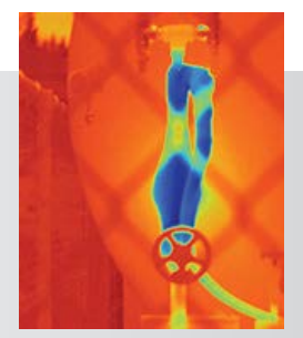
LaserSharp® Auto Focus with a built-in laser distance meter clearly captures your designated target.