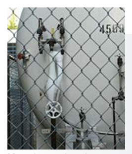
Many inspection sites are challenging for certain autofocus systems.

AutoFocus Redesigned LaserSharp® Auto Focus, uses a built-in laser distance meter that calculates the distance to