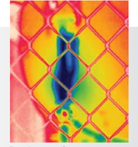
Passive autofocus systems may only capture the near-field subject (chain link fence).